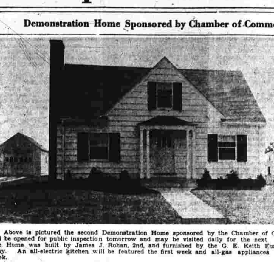
Demonstration Home Sponsored by Chamber of Commerce

Chamber Demonstration Home Opens Tomorrow. Located on High Street in Bluefields Tract It Has Been Planned for Mid-Income Family.